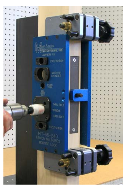
Using a 1-1/8" hole saw, drill the hole for the lock spindle. It is drilled to the mortise cavity.