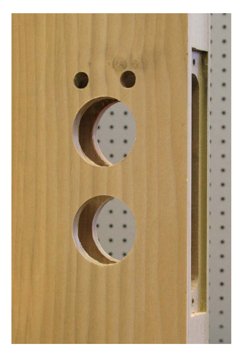
Completed lock prep. Install lock per manufacturers directions.