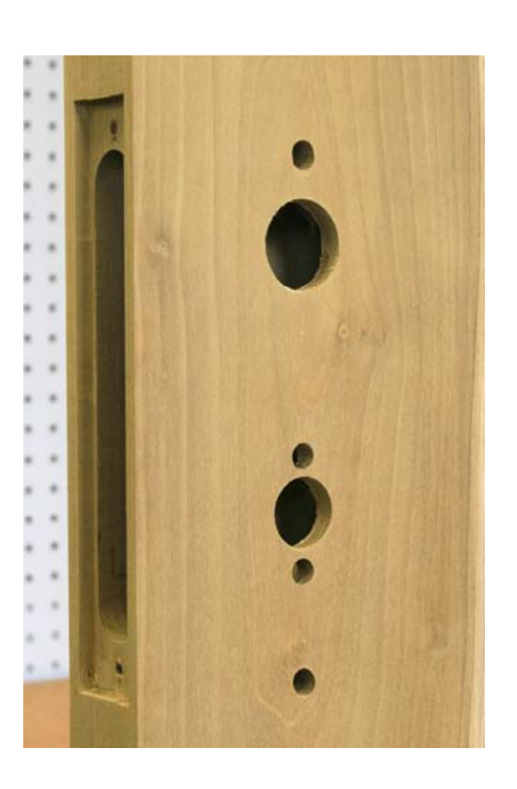
Install lock per manufacturers directions. That's all there is to it!

Visit our web site at <a href="www.majormfg.com">www.majormfg.com</a> for more information on lock templates and a complete listing of all the tools we have available. While there, sign up for our newsletter and we will email new product information directly to you.