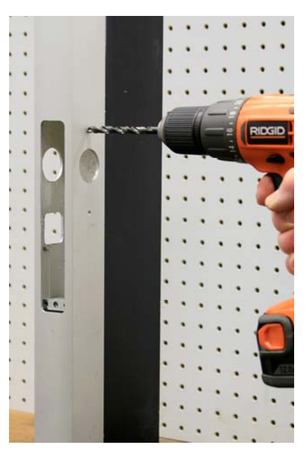
Remove the lock from the door and enlarge the two holes to 17/64" with the use of a twist drill.