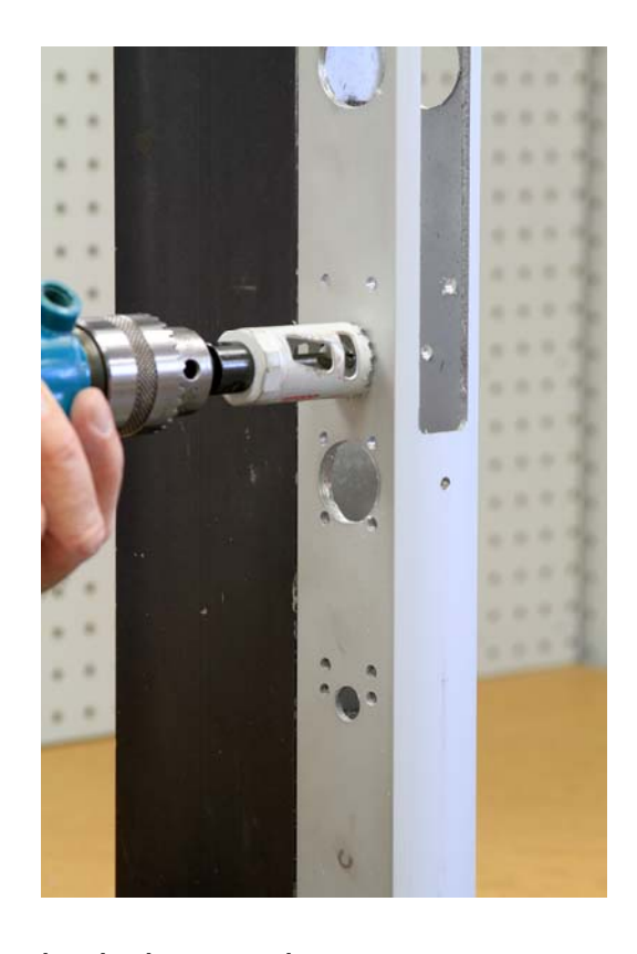
Use a 1-1/8" hole saw and drill the two exterior holes as shown.