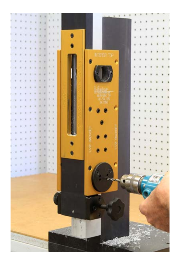
Change to a 3/16" and drill the remaining 6 holes on the inside template. Four are on the template and two are on the large drill guide.