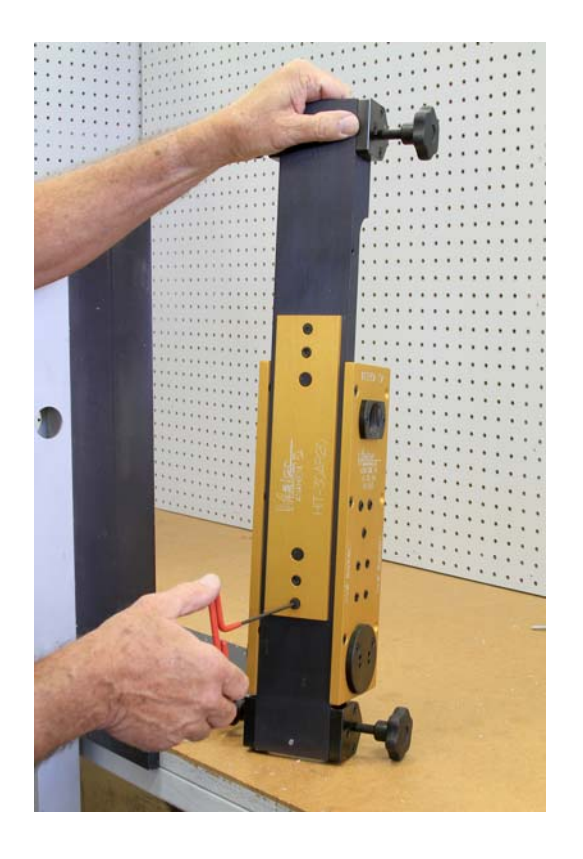
If retrofitting, install the HIT-30AR20 to the clamp and align it in the existing faceplate cutout.