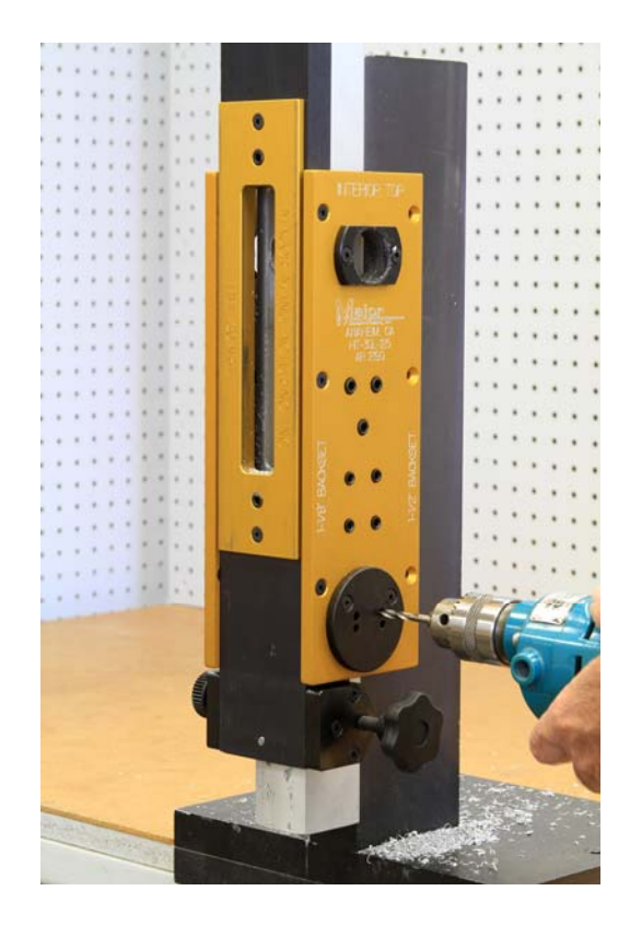
With the 13/64" drill bit still in the drill, drill the two top holes on the large drill guide at the bottom of the template